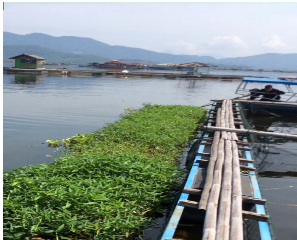
water kale aquaponics

The harvested fish from the KJA farmers consists of golden fish and parrot-fish. The golden fish is harvested every four months with an average harvest of 1,250 kg. The parrot fish is harvested once a year with an average harvest of 600 kg.