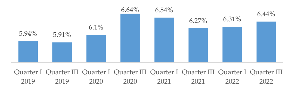
Figure 1. Poor Population in East Kalimantan

In Indonesia, East Kalimantan has the tenth lowest poverty rate in the country (Prabawati, 2022). According to data from the Central Agency in Statistics, the poverty rate in East Kalimantan tends to be on a fluctuating trend. However, the poverty rate in East Kalimantan has generally increased from Quarter I 2019 to Quarter III 2022, as shown in Figure 1. In the first quarter of 2019, the number of poor people increased by 219,920 (or 5.94%), but in the third quarter of that year, it decreased by 220,910 (or 5.91%). In the first quarter of 2020, the number of poor people increased by 230,260 (or 6.10%), while in the third quarter of that year, it increased by 243,990 (or 6.64%). In the first quarter of 2021, the number of poor people decreased by 241,770 (or 6.54%), and in the third quarter of that year, it decreased by 233,130 (or 6.27%). In the first quarter of 2022, the number of poor people increased by 236,250 (or 6.31%), and in the third quarter of that year, it increased by 242,300 (or 6.44%) (Central Statistics Agency of East Kalimantan Province, 2022).